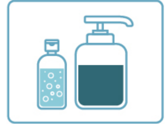
Use soap & antibacterial gel