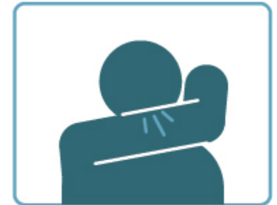
Cough in the elbow